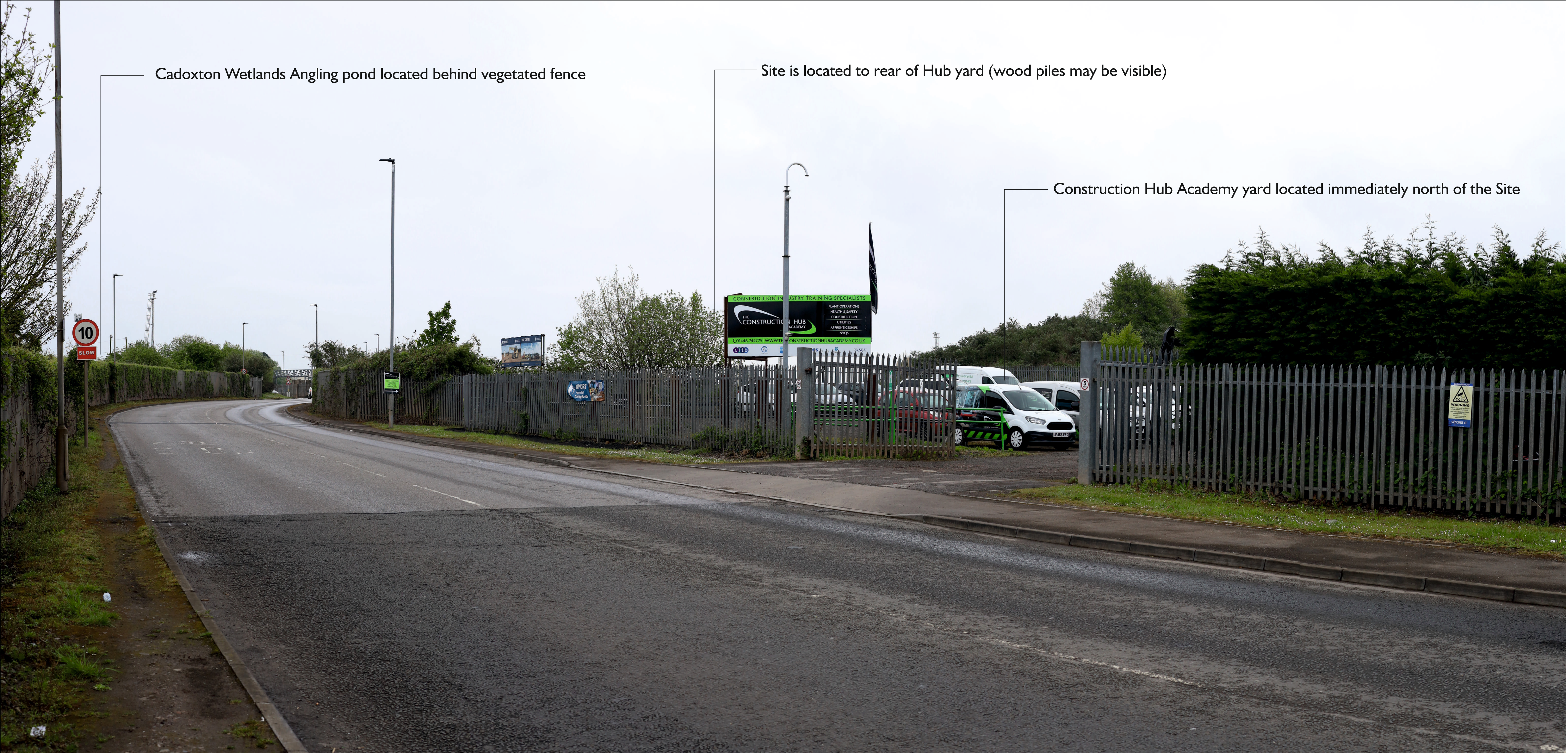
Representative Viewpoint 9 - Looking south from Wimborne Road, near junction with Ffordd Y Mileniwm